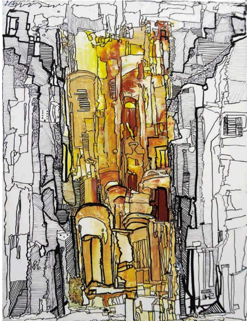
28-Illusion of Opulence II Medium: Acrylic on canvas Size: 80X60 cm Signed & Dated 2016 Price: 30,000 EGP Price: 1,900 USD